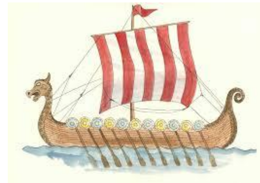
The Vikings travelled across the seas in Longships.