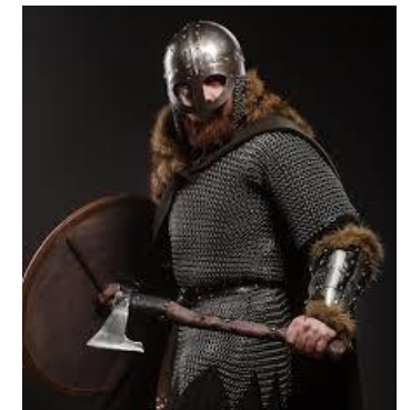
A Viking warrior