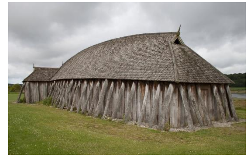
A Viking longhouse