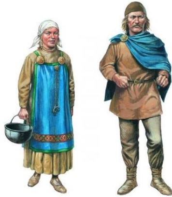
Viking clothes and jewellery