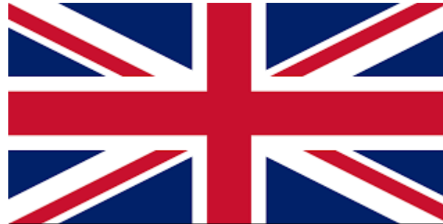
United Kingdom Flag (Bamburgh)