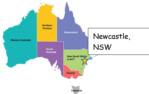
Map of Australia