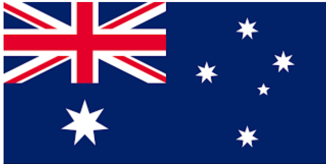
Australian Flag (Newcastle, NSW)